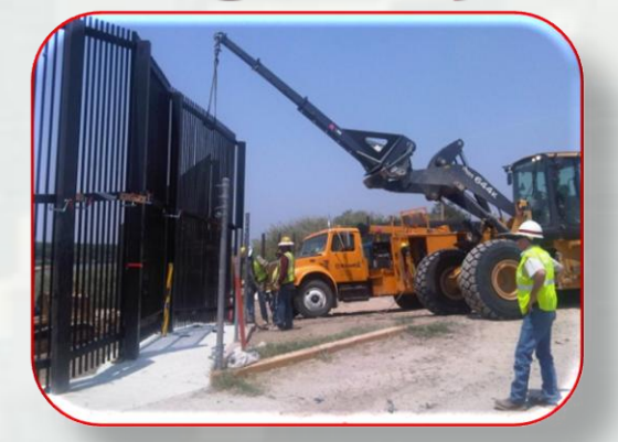
Eagle Pass, Texas, Border Fence Construction

Nogales, Ariz., Border Fence Replacement